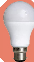
AC - DC RECHARGEABLE BULB